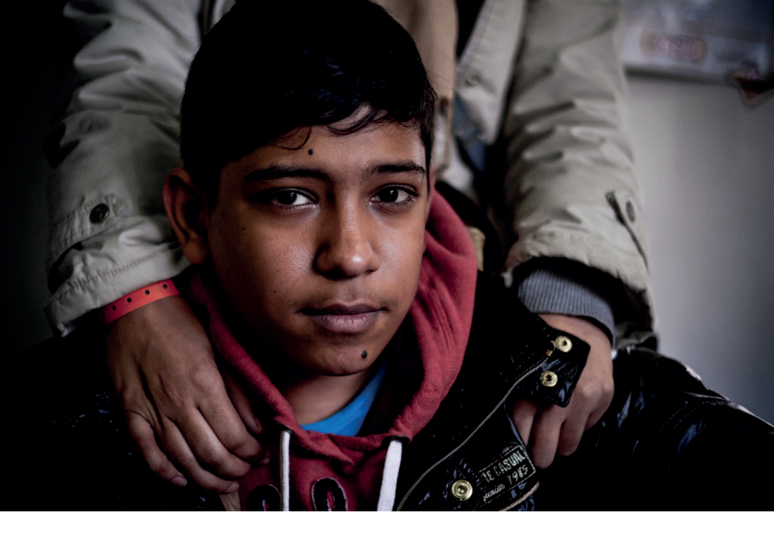
"Transfer" or "passing back" rather than "return", are the terms recommended in the Return Handbook to describe the conveyance of a third-country national to another EU Member State under the Dublin III Regulation (Return Handbook, p. 9). Article 6 of Regulation 604/2013 dictates that "the best interests of the child shall be a primary consideration for Member States with respect to all procedures provided for in [Regulation 604/2013]". The present study takes into account information on transfer under the Dublin III Regulation where appropriate.

Experts state that most deportations conducted in Germany are transfers to other EU Member States under the Dublin III Regulation. From an operational standpoint, these transfers do not differ from deportations to countries of origin. According to one respondent, families subject to transfer under the Dublin III Regulation are seldom offered the option of voluntary departure or access to voluntary return programmes. This is detrimental, since voluntary departure is less traumatic for children than deportation. Giving parents the option of voluntary departure is requisite in view of their children's well-being.