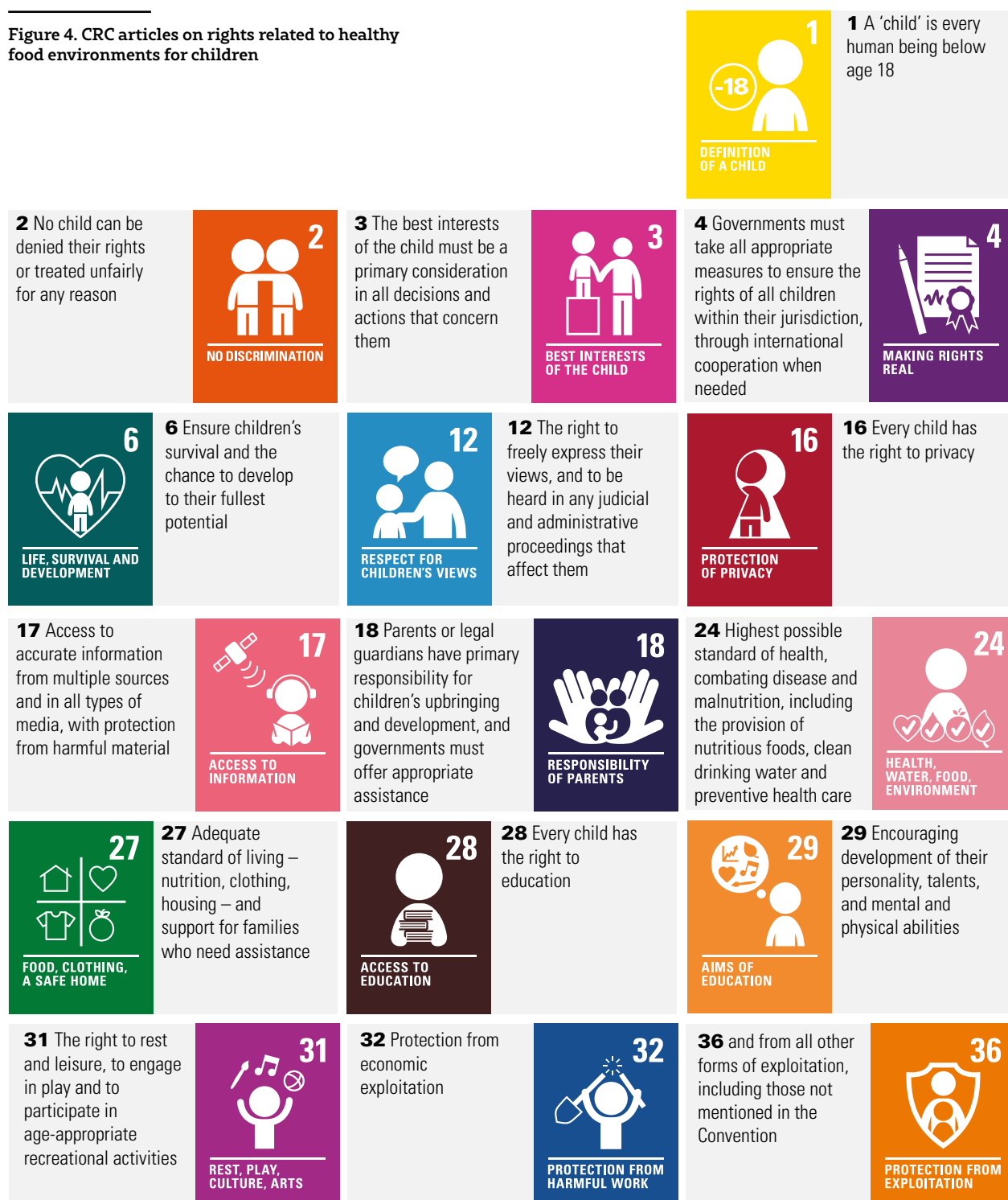
Figure 4. CRC articles on rights related to healthy food environments for children