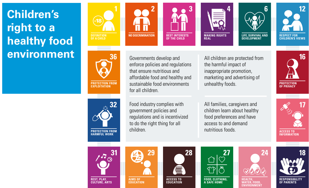
Figure 5. The rights enshrined in the CRC are interlinked and mutually supportive

Because the CRC is an international human rights treaty, governments that ratify it are legally bound to uphold their commitments and be accountable for its implementation, including by introducing measures to advance children’s rights.